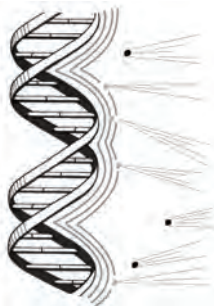
Flavonoids can create a protective 'shield' around DNA

Excessive free radicals cause DNA damage. Potentially dangerous free radicals are mopped up in the body by antioxidant enzymes and by antioxidant compounds such as vitamins C, E, K2, and nutrients such as lycopene, lutein and the flavonoids.