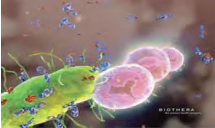
A virus is attacked (above) by a Natural Killer Cell that has been primed by 1-3, 1-6 beta glucans (Wellmune)

Many researchers have shown that the innate immune system's ability to kill cancer cells is boosted by a compound called 1-3, 1-6 beta glucans derived from baker's yeast. It is also enhanced by vitamin D and, in certain situations, by beta sitosterol, derived from seeds and nuts.