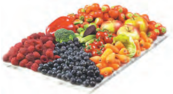
Cancer experts now recommend 9 -11 portions of fruits and vegetables a day!