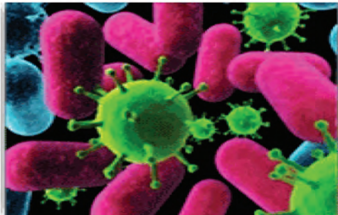
Antibodies (represented purple) are produced to deal with a viral threat (green) that the body has encountered before.

This more recently evolved part of the immune system has 'memory' and is able to mount very specific antibody defences.